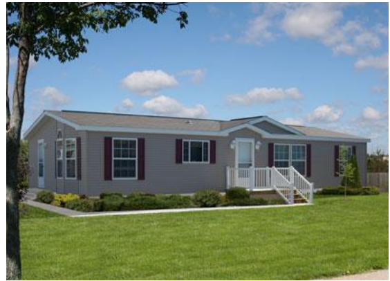
Sample picture only

What are you waiting for? Don't miss this opportunity!! Up to $8,000 Federal Home Buyer Tax Credit for qualified 1 st time home buyers on your new/used manufactured housing purchase.